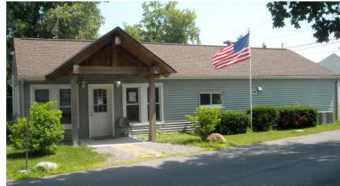
The Richard R. Murray Guilderland Animal Shelter Frenches Mill Road Guilderland Center, NY 12085